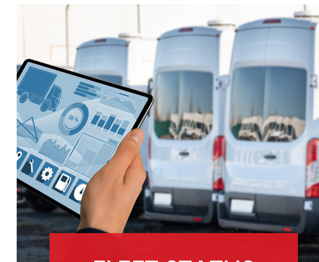
FLEET STATUS DASHBOARD