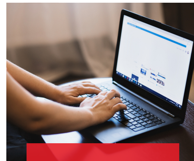
LABELS & SEARCH